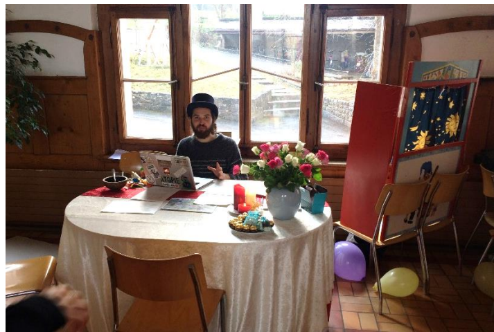
The Bank of Transformation opened some spaces to share and brainstorm about our relationship with money

As an experiment for the period of the course, we founded the Bank of Transformation and produced an alternative currency called Wonga , with the aim of rethinking ownership, consumption and our relationship to money and banks. The EDE community joyfully embraced the Wonga and found creative new ways to play the money game. Nevertheless, we see an even larger potential for the Bank of Transformation with more time and preparation before next year's EDE.