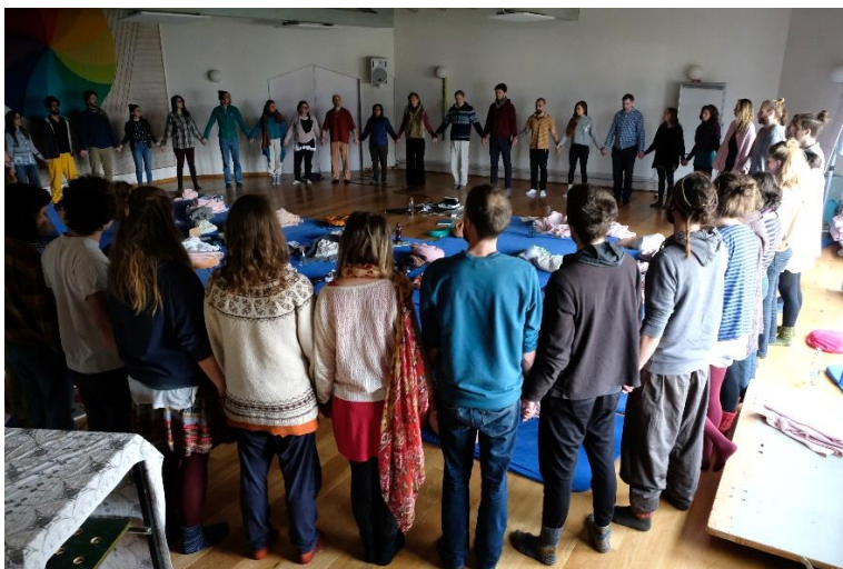
Circle culture was taught as an important aspect of community life

Within the social dimension, the course programme had sessions on Sociocracy 3.0, Possibility Management, Scott Peck community building, Dragon Dreaming, Nonviolent Communication, embodied leadership, feedback and deep listening, transparent communication, Let's Talk About Sex, rank and hierarchies. During the third week, Forum was offered every afternoon with different