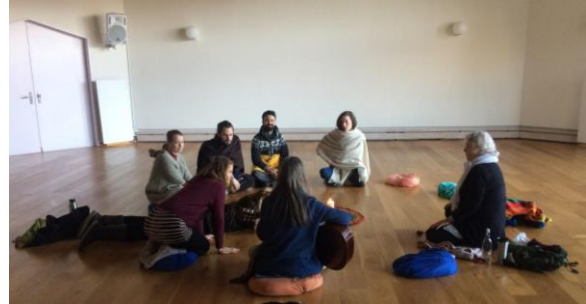
Morning team meeting

Every day we met for half an hour all together as a team. Usually we divided the time to take 15 minutes of “check-in” and sharing and 15 minutes of logistics. With the days filled with tasks and business, this was usually our only time of the day to be all together, and a really good way to keep in touch and feel into every team member.