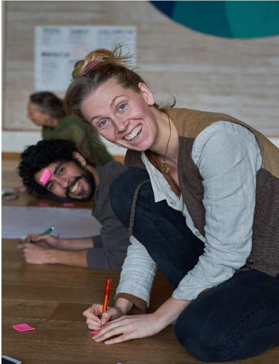
Project group time!

The design dimension was realized through the applied work on projects that the participants brought with them. During the first week we had a morning of project pitches, where we saw more than 20 presentations of participants sharing their project dreams, whether still a seed or already in action. We continued with a World Café, to find out more about the project ideas and perhaps already start dreaming together. At the end of the day, nine groups had formed. A 10 th project group (The Italian House) developed spontaneously out of a Gift Circle in the second week. Work on the projects began with a guided Dragon Dreaming process of finding a common vision and mission. It then flowed into self-organized working processes where tools and lessons learnt throughout the course could be applied. Support from the team was available when needed. In total, the groups spent at least 18 hours on their projects, and additionally had a weekly evening of sharing and being together. The last few course days were all about finishing up the work on the projects: last decisions needed to be taken, group tensions resolved, presentations wanted to be prepared and rehearsed and project reports finalized. On the last day, all groups presented their projects (in incredibly creative ways) and had a final chance for reflection, appreciation and celebration.