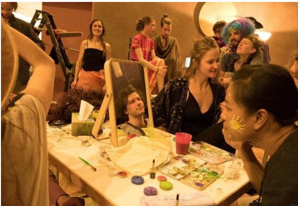
Left: Make-up and costumes preparation for the EDE midterm party

After the evening sessions, the seminar halls were free for participants to organize themselves in dancing, movies, music jams or playfight sessions. We also had two vibrant, super fun parties involving costumes, face paint, performances and games. Sundays offered free time for participants. Most Sundays we had a self-organized open space where participants proposed activities to share their skills, knowledge and interests or just have a good time together. Trips to nearby towns or attractions (Rhine waterfalls, Hermann Hesse museum) were coordinated by an assistant. Every Sunday evening, we were able to heat the sauna of the Schloss Glarisegg community and jump into the cold lake afterwards!