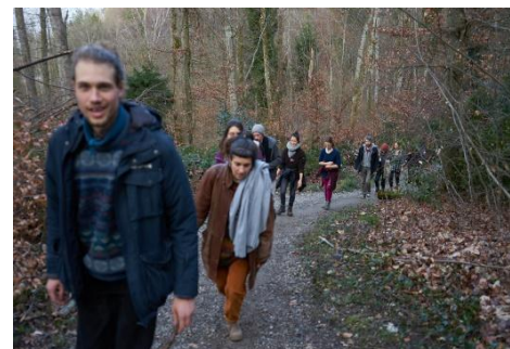
Participants on the way to the ruins for a ritual

In the worldview dimension we looked at Spiral Dynamics, Theory U, Dragon Dreaming, alternative health and self-care, and practiced Joanna Macy's Work That Reconnects. We offered one evening of women / men / star* circles, and the participants took this up and self-organized more circles during free evenings. Several meditation sessions and rituals were held as part of the course programme, such as a water/grief ritual with Stimmvolk , a ritual to connect with our ancestors and a sweat lodge ritual. Singing and dancing was an integral part of community building and daily routines during the whole EDE. Contact Improvisation, Authentic Movement, Playfight, Ecstatic Dance and LifeDance were offered optionally as somatic practices for embodiment. One of the four strands falls into the worldview dimension: Find your inner healer .