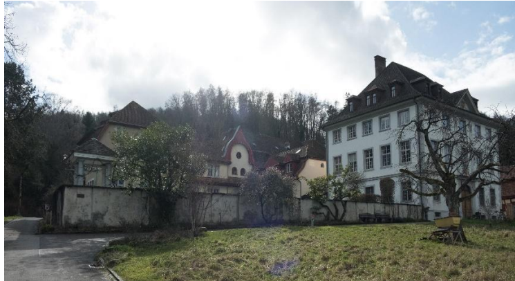
Schloss Glarisegg in the January sun

Schloss Glarisegg community was founded in 2003 at Glarisegg castle on the Swiss side of Lake Constance as “a place for encounter and awareness”. The community has more than 50 members who mainly use the Scott Peck method of community building, and welcome other methods such as Forum and Possibility Management for continuous community development. The project also includes a free school, a permaculture garden, a food cooperative, a lake bistro, a meditation house and a seminar center with guest house and campsite. A wide range of courses and seminars are hosted throughout the year. Many healers and therapists call Glarisegg their home and offer their gifts at the place.