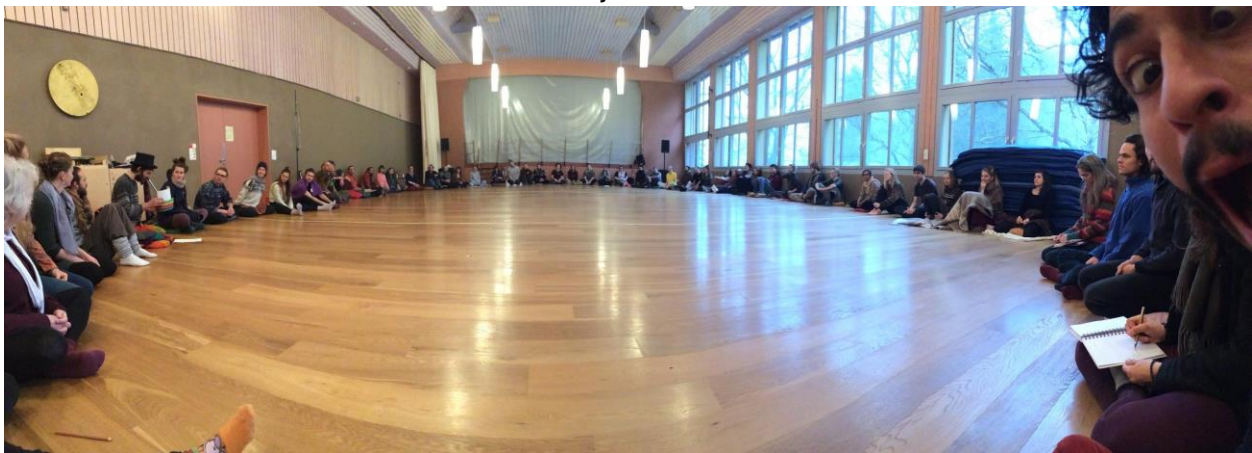
The morning circle is an important part of the day and gives a great opportunity to meet everyone in a biiiiig circle.

This routine community time is an important moment of gathering. Starting with a different song each morning, somebody reads a poem for the day. A round of looking into the eyes of the neighbors is also the opportunity for a round of “welcomes and goodbyes” of people to briefly present themselves to the community or to announce their leaving. After a common stretch by holding hands together “up to the sky and down to the earth”, the Day Director (one of the assistants) reads out the announcements that were collected in a basket. Morning circle is also the opportunity for birthday celebrations. Schloss Glarisegg community members were always invited to join the circle.