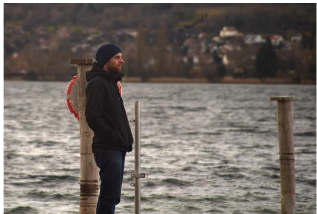
Right: The lake is a good place to integrate the new experiences on a free Sunday